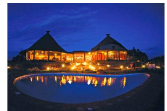
Ngorongoro Sopa Lodge

August 17 – 19 to Serengeti National Park (Nasikia Luxury Camp) - from Ngorongoro Crater