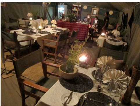
Nasikia Luxury Camp Dinning

August 17 – 19 to Serengeti National Park (Nasikia Luxury Camp) - from Ngorongoro Crater