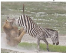
Lion vs. Zebra Ngorongoro

August 16 – To Ngorongoro Crater (Sopa Lodge) - from Arusha NP After breakfast, we will leave Arusha by Toyota Land Cruiser, cross the Maasai Steppe in route to the Ngorongoro Conservation Area. Our road will take us up the Great Rift Valley Escarpment over 2,000 feet high rising up out of the plains. We will continue to Ngorongoro Crater itself. The crater is world-renowned even though it is relatively small as Africa goes. The Crater floor is about 100 sq mi. with a wildlife population of over 50,000 including 100+ lions. We will have a picnic lunch on the crater floor.