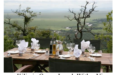
Kilimia Camp, Lunch With a View

The Masai Mara is world famous for its black-maned lions and the annual migration of the wildebeest, listed as one of the eight natural wonders of the modern world. We will spend 2½ days photographing the wildebeests and zebras crossing the Mara River and the resident and migratory predators of the region. As we cross the Masai Mara plains, we will focus our attention on lions, leopards, hyenas and other species of wildlife including several hundred species of bird.